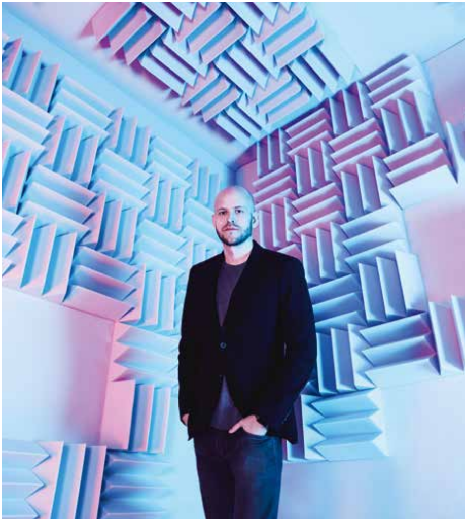
Daniel Ek, Spotify, September 2018