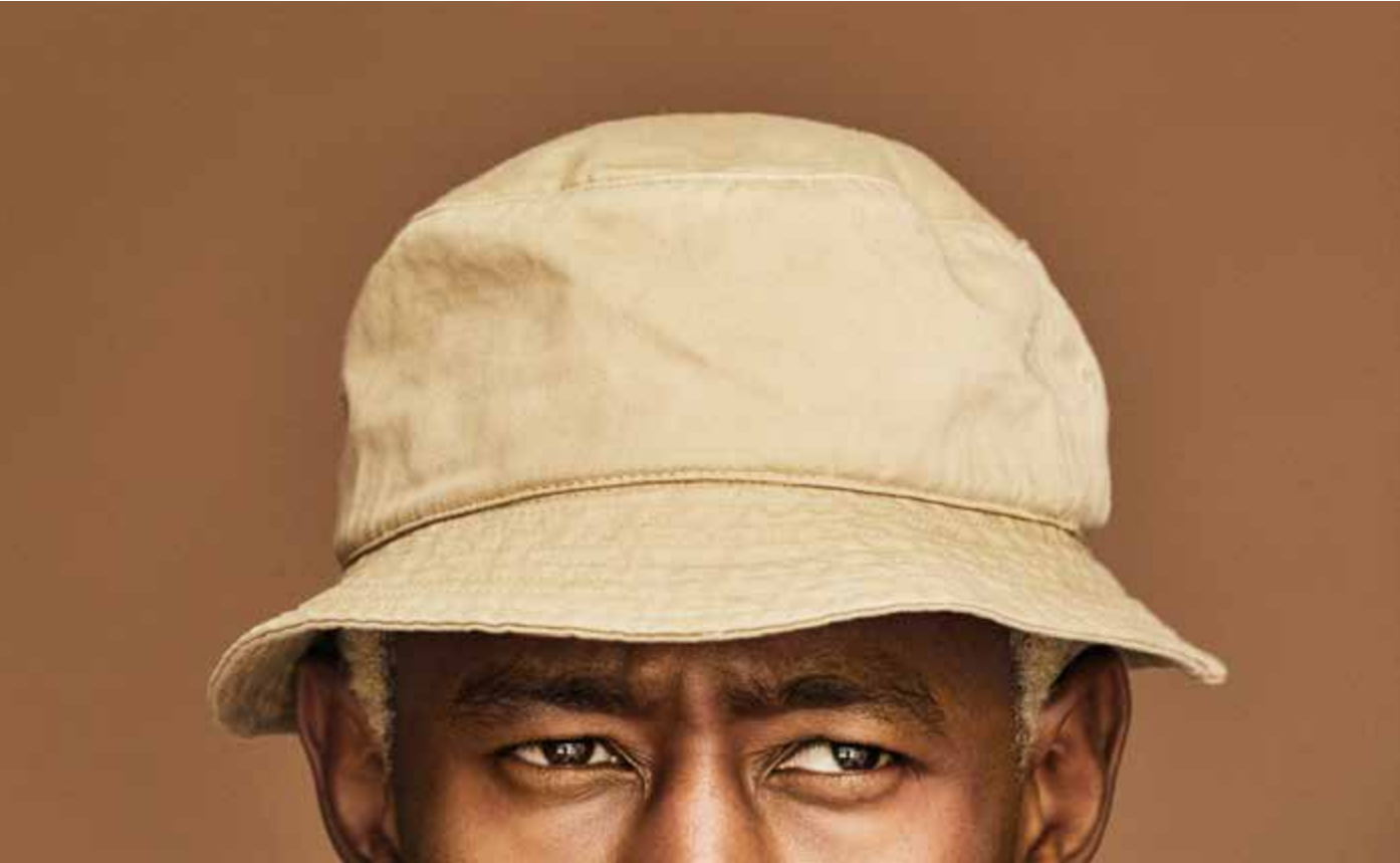
Tyler, the Creator, November 2018